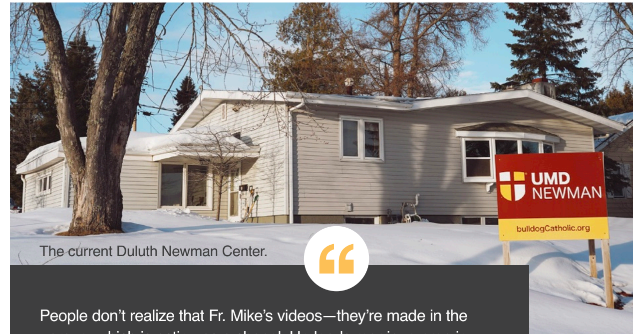
The current Duluth Newman Center.