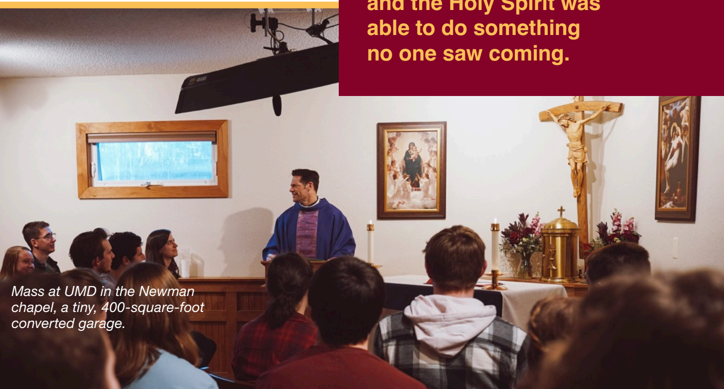
Mass at UMD in the Newman chapel, a tiny, 400-square-foot converted garage.