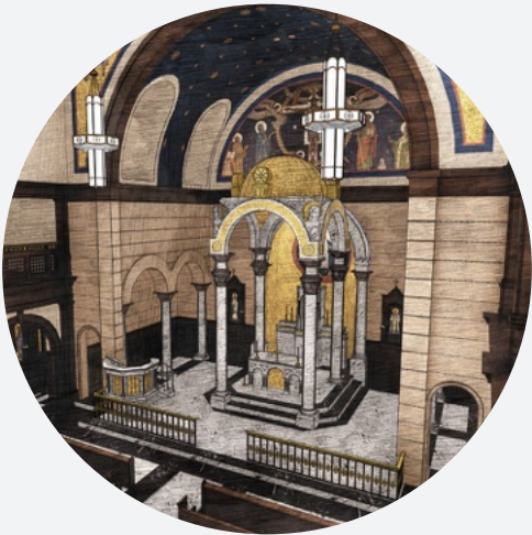
Initial concept drawing of the church’s interior.

Worship is the greatest thing we do. We strive to give God what He deserves in every aspect of our lives, but especially when it comes to the Holy Sacrifice of the Mass. Quoting Fyodor Dostoevsky, Pope John Paul II stated that “beauty will save the world.” We dream of a church—dedicated to Our Lady of Victory and Our Lady of Sorrows—that will not only engage the minds, hearts, and souls of our students, but will above all give God the glory He deserves.