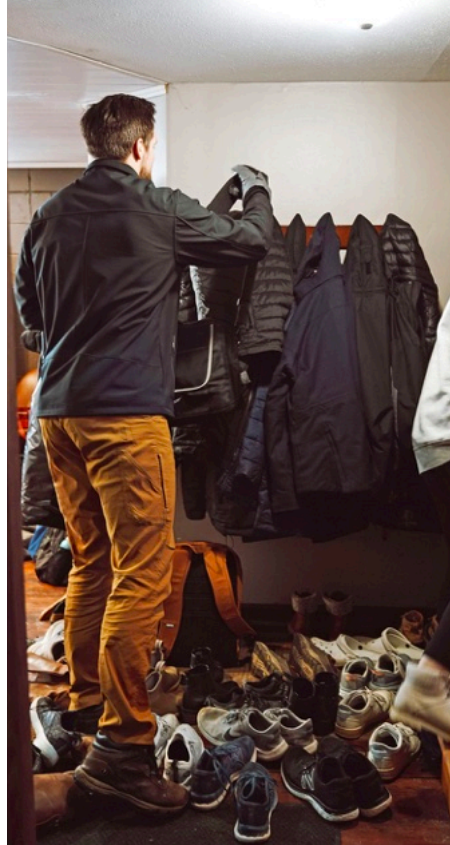
A student hangs up his jacket before Mass at the entrance to the current chapel.